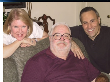
William Windom as Matthew Decker

In an adventure that spans centuries, Captain Kirk fights alongside a U.S.S. Enterprise from the past to stop the devastating "Doomsday Wars" that should never have happened. In a universe forever changed by those events, the crew of the Enterprise must once again battle the powerful juggernaut known as the "Doomsday Machine."